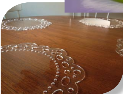
Clear or Branded Acrylic Placemats