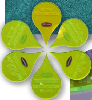
Double-Etched, Printed, and Laser Cut Color Acrylic