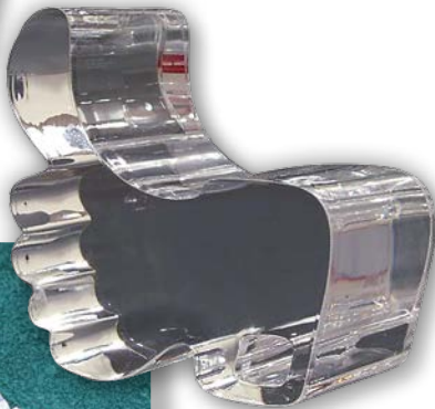
Top: Crystal Clear Thumbs-Up on 1" Acrylic