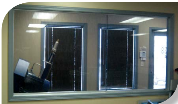
Complete see-through from the back side