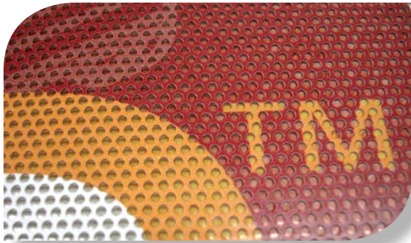
Perforated see-through window film