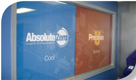
Viewing from the image side