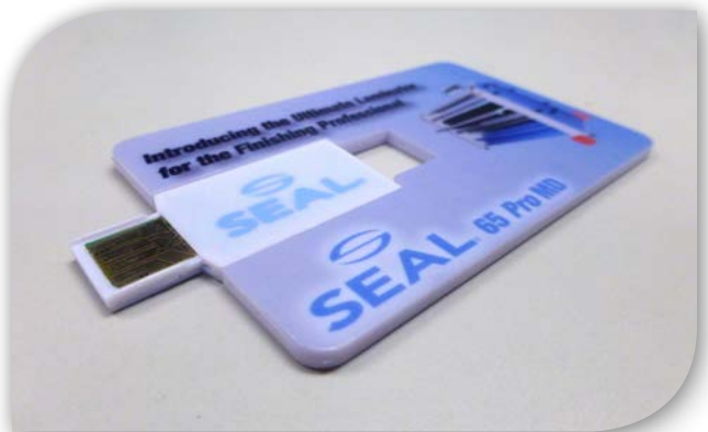
Full-bleed, double-sided printing is available