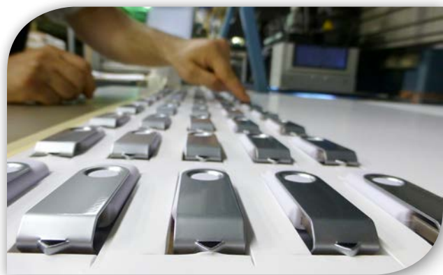
Custom templates ensure accurate positioning