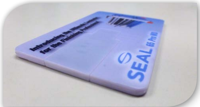
Credit card USB drives are great for marketing