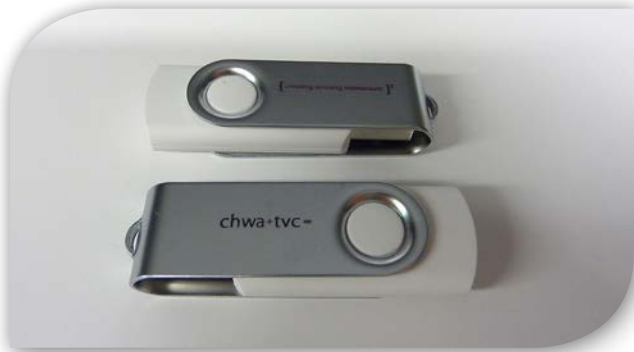
USB thumb drives can be customized on both sides