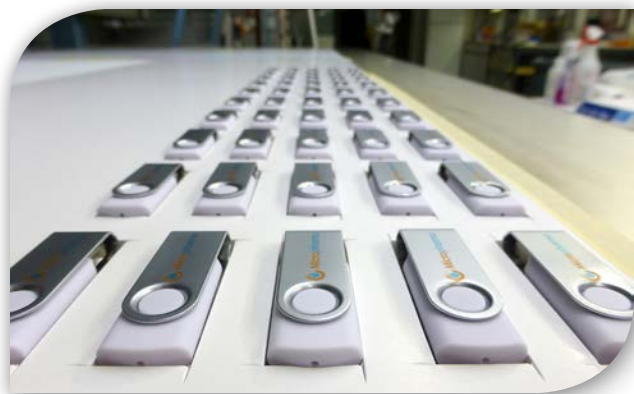
Large printing table yields lower cost per drive