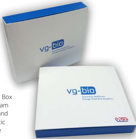
Test Kit Box with Foam Insert and Magnetic Closure