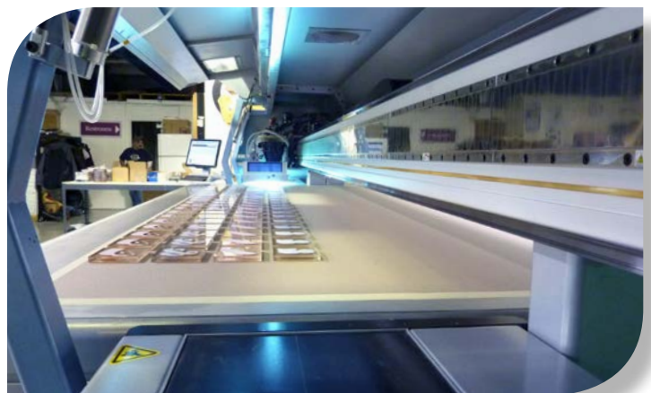
Coasters are held securely on a vacuum table during printing. Hundreds of parts are printed at the same time for maximum cost efficiency.