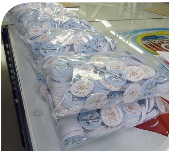
Printed, cut, bagged, and delivered