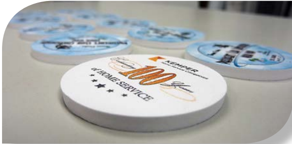
Finished poker chips