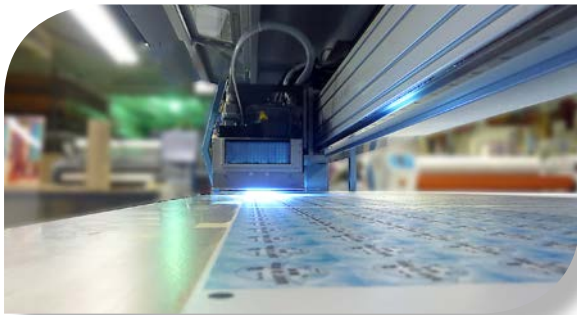
UV lamp cures ink instantly with excellent scuff resistance and durability