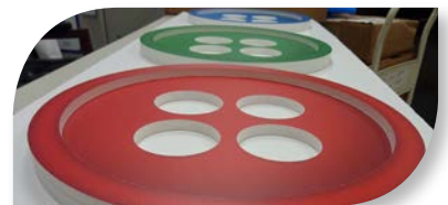
Thick foam buttons