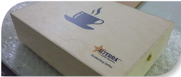
Wood box lids