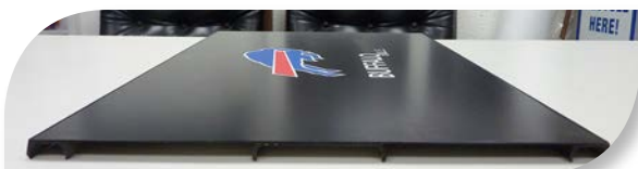
Pre-fabricated metal parts