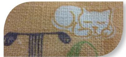
Soft cloth fabrics