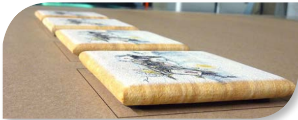
Ceramic, porcelain, or stone tiles