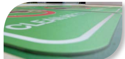
Metal street signs