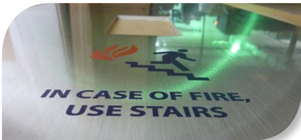
Solid aluminum elevator panels