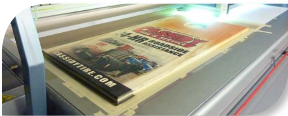
Pre-fabricated plywood panels