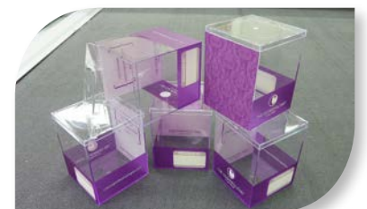
Acrylic boxes with double-sided graphics