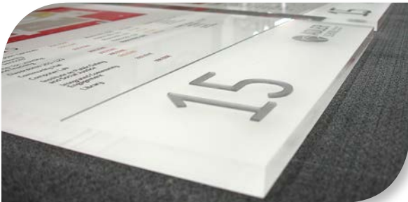
Material thickness up to 2" thick