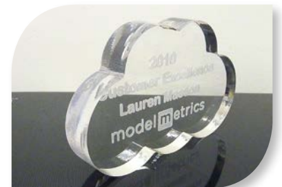
Etched acrylic with flame-polished edges