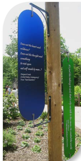
Durable outdoor ink on frosted plexiglass