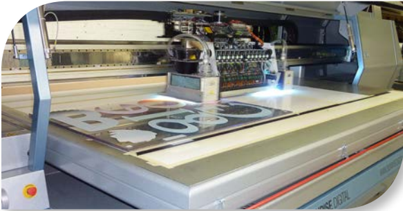
UV flatbed printing with opaque white ink