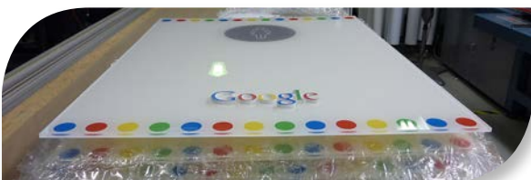
Directional panels with 3-dimensional lettering