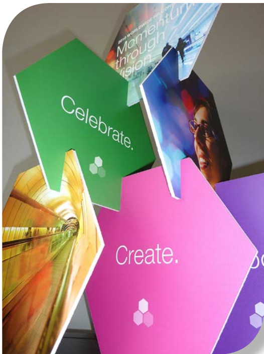
Attention-grabbing 3-dimensional design