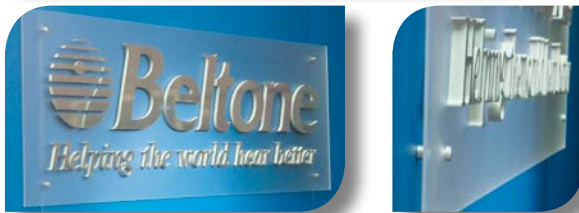
Frosted acrylic logo panel with 3D logo and lettering