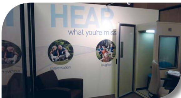
Custom wallpaper covering