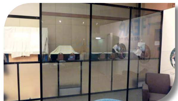
Back side of see-through window graphics