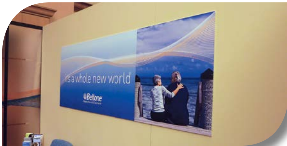
Frameless wall posters