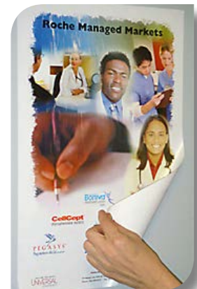
Peel and stick, reposition any time