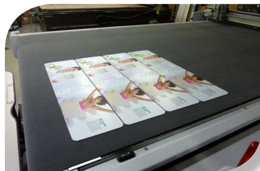
Panels being cut on CNC digital router