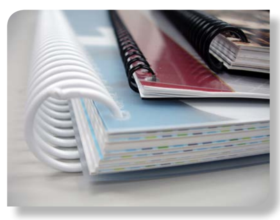
Double-O wire and spiral coil binding