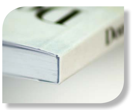
Perfect binding with hinge score