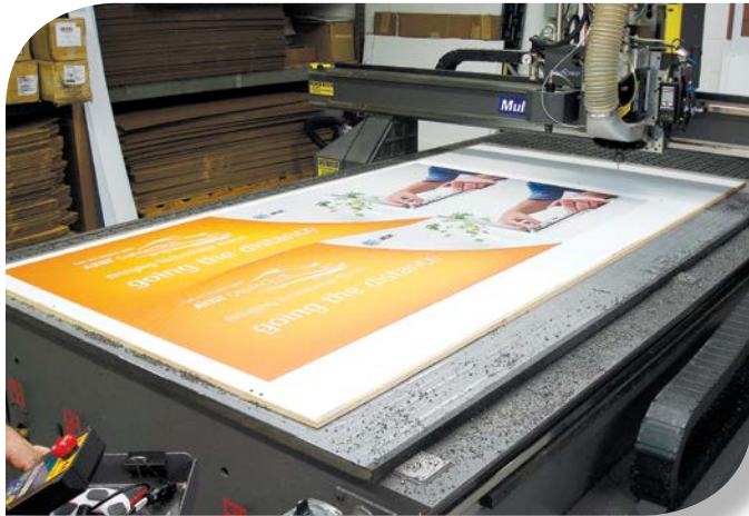
CNC Contour Cutting

Size: 72"x24" Material: 15pt white styrene Printing: 4-color process, 1-side Cutting: CNC contour cutting Quantity: 360 banners