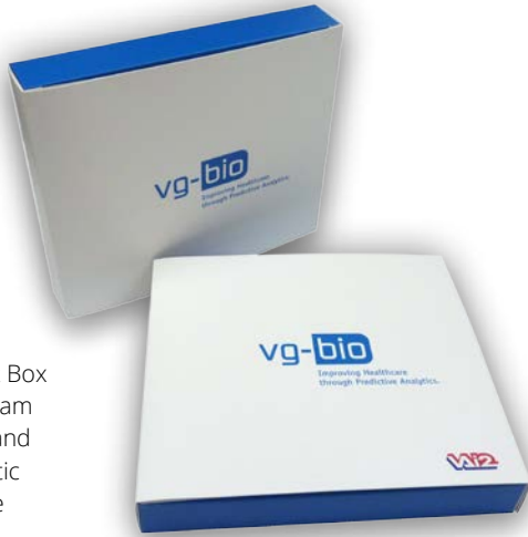
Test Kit Box with Foam Insert and Magnetic Closure