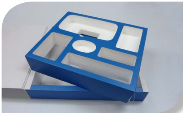
Custom printed and glued foam tray cover