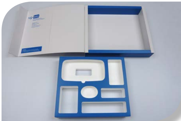
Double-wall bottom tray and insert