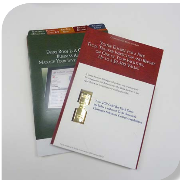
Finished USB holder and tab-cut brochures