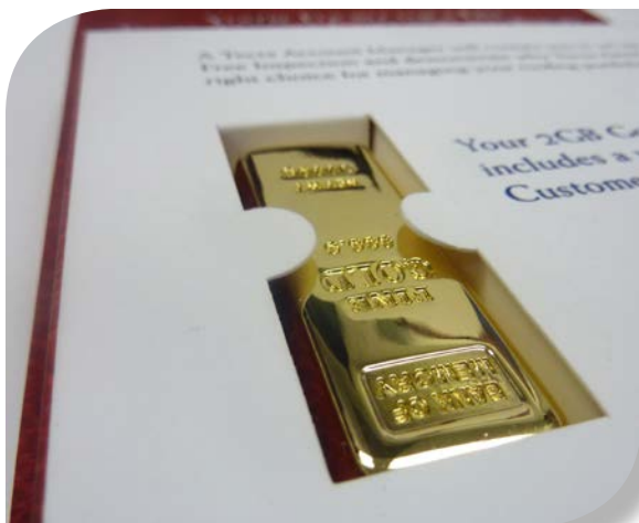
Wing tabs keep the USB drive from falling out