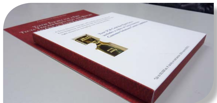
Soft-touch matte lam adds protection and refined aesthetic