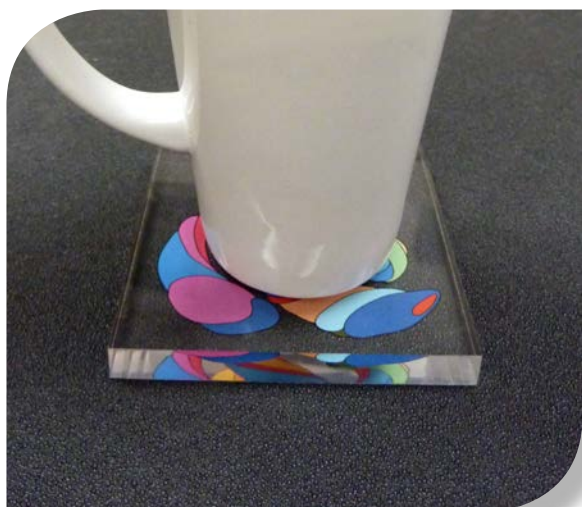
With opaque white ink backing, these coasters can be placed on any color surface and still maintain clear visibility.