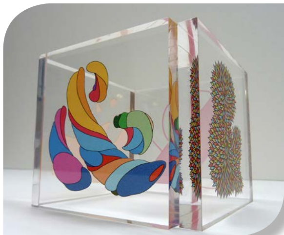
Crystal clear acrylic coasters, 4 coasters per set.