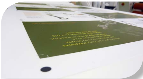
Printed registration marks and optical alignment ensure the cutting is perfect every time