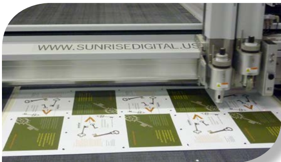
Cutting is done in multiple passes using different tools optimized for each material