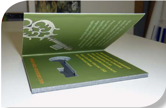
Finished USB drive holder