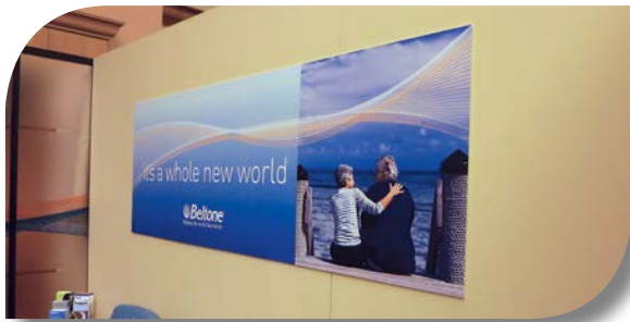
Frameless wall posters