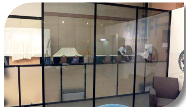
Back side of see-through window graphics