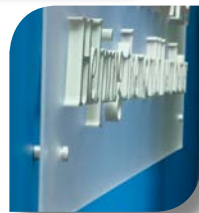
Frosted acrylic logo panel with 3D logo and lettering