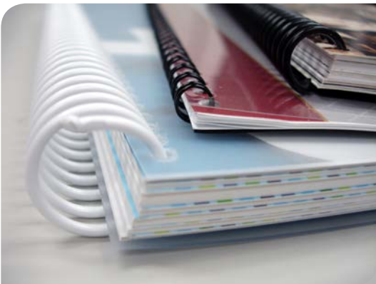
Double-O wire and spiral coil binding