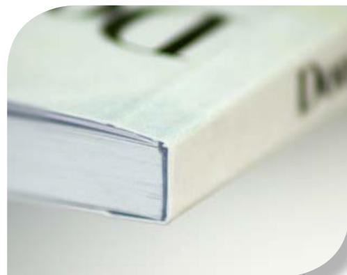
Perfect binding with hinge score