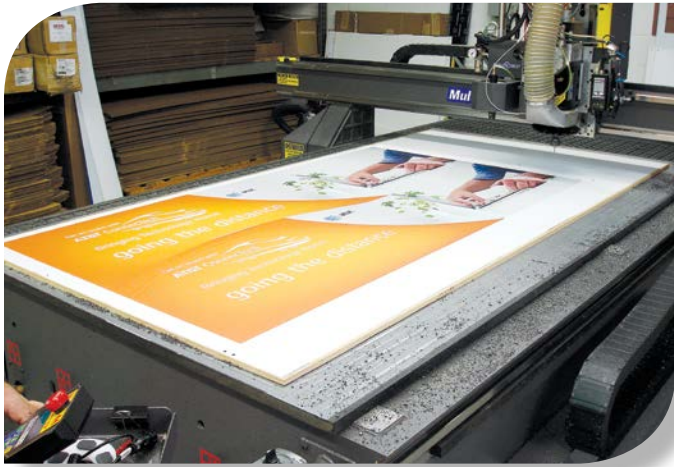
CNC Contour Cutting

Size: 72"x24" Material: 15pt white styrene Printing: 4-color process, 1-side Cutting: CNC contour cutting Quantity: 360 banners