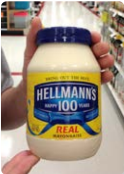
Actual Product Sample