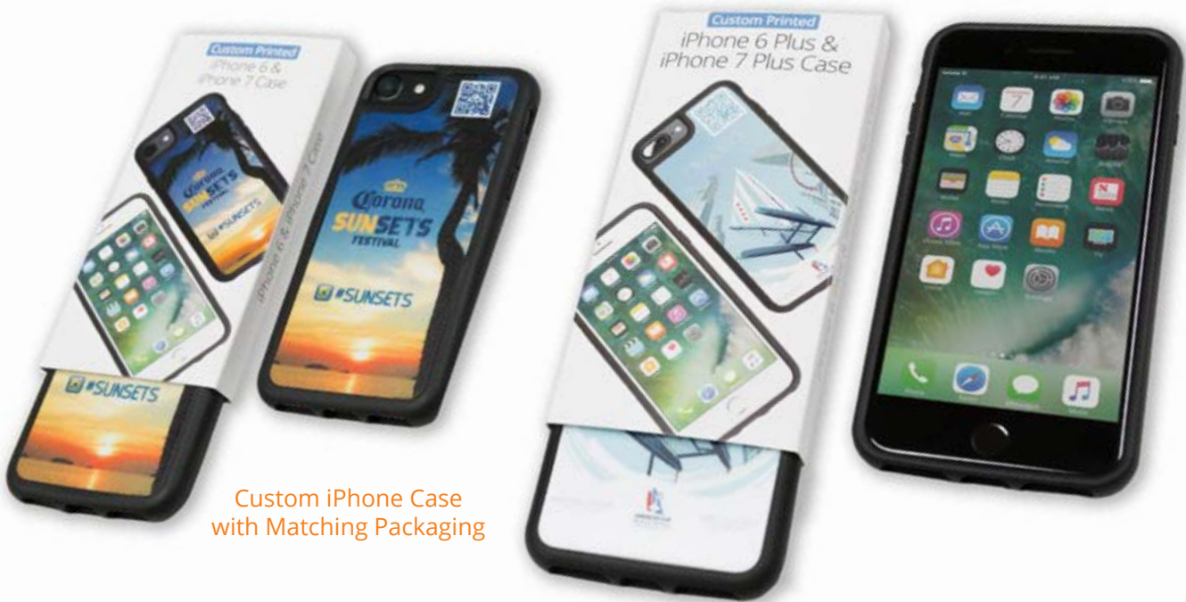
Custom iPhone Case with Matching Packaging