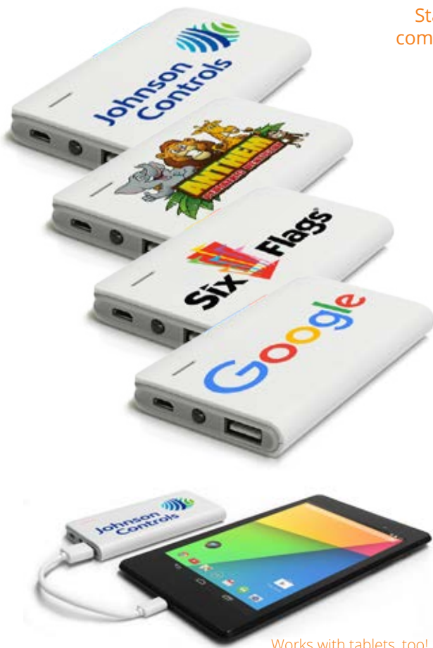
Works with tablets, too!