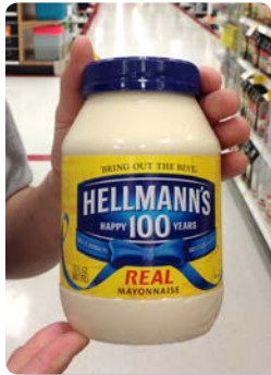
Actual Product Sample

Supply Your Artwork As Digital Rendering in 3 Days Finished Product in 3 Weeks