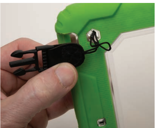
Feed cord around the support and back through the hole. Tuck the clip end through the opening.