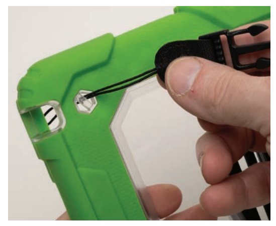
Remove the iPad from the case and feed cord end of strap holder though opening.