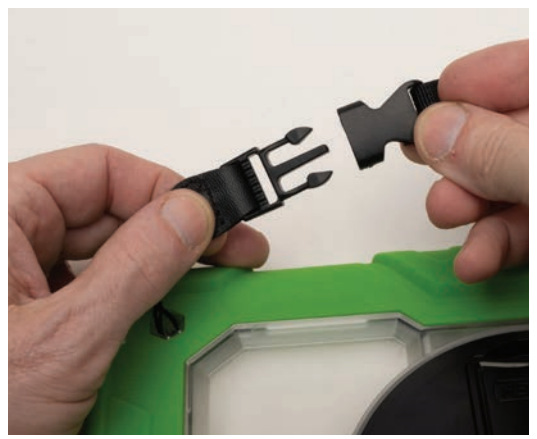
Pull the clip to tighten the cord. Attach the shoulder strap with the clips.